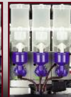
Fresh Brew Version